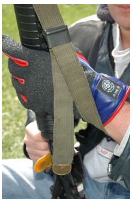
6. The sling should now push flat against the back of your hand.