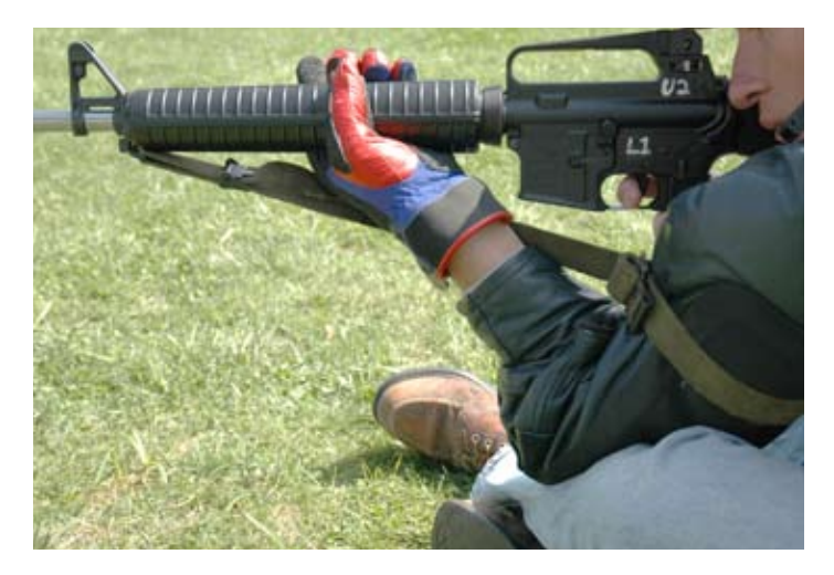
7. This view shows the left side of the final position.