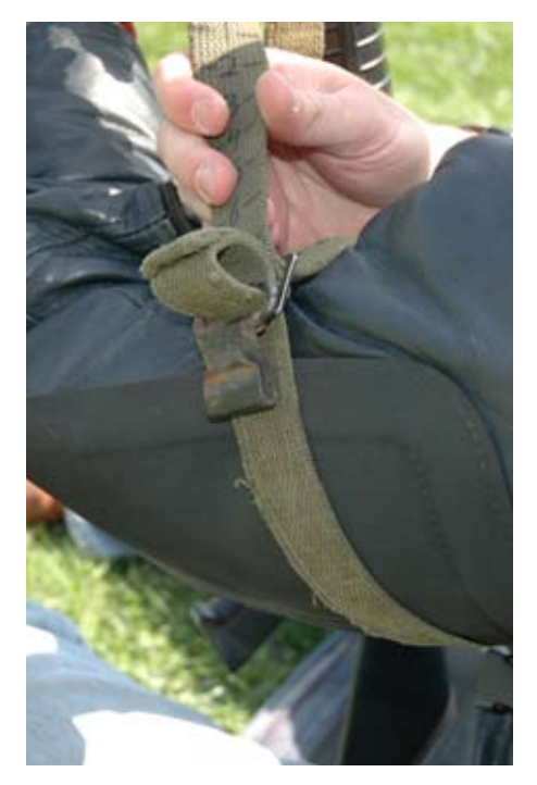
4. To tighten the sling on your arm, just grab the strap and pull away from your bicep as illustrated in the photo. Before tightening, it might be best to arrange the sling so the buckle is towards the outside of your arm. Then, when the sling is tightened, it moves closer to the center of your bicep.