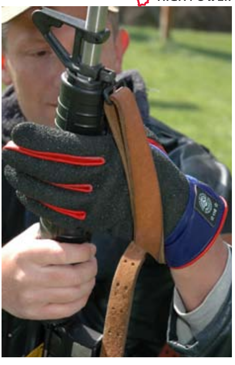
This front view shows how the sling wraps around the back of the hand.