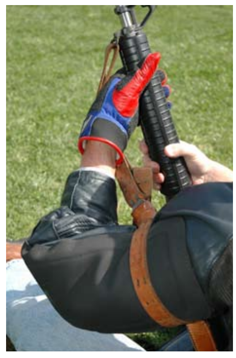
6. The lower loop should now be wrapped around your arm with the two leather keepers holding the loop together. The hook should be pressed into the top keeper so that the loop does not open under tension. Push the sling away with the back of your left hand and put your hand where your arm length dictates on the rifle's fore-end. The sling should now push flat against the back of your hand.