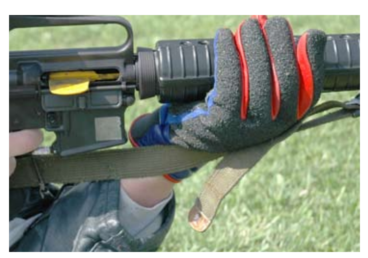
8. This is the right side.