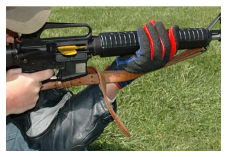
9. This is the right side.