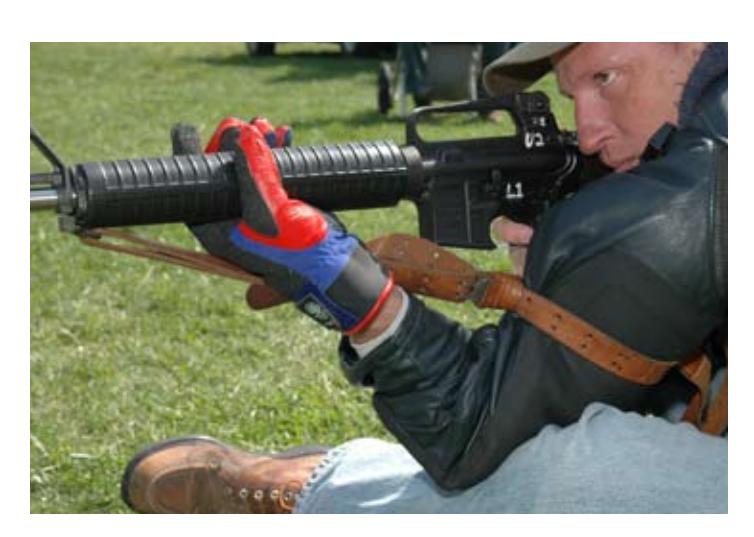
8. This view shows the left side of the final position.