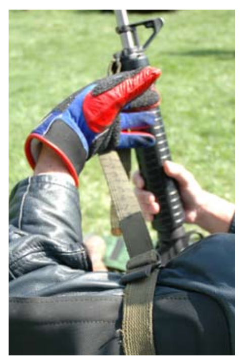
5. Push the sling away with the back of your left hand and put your hand where your arm length dictates on the rifle's fore-end.